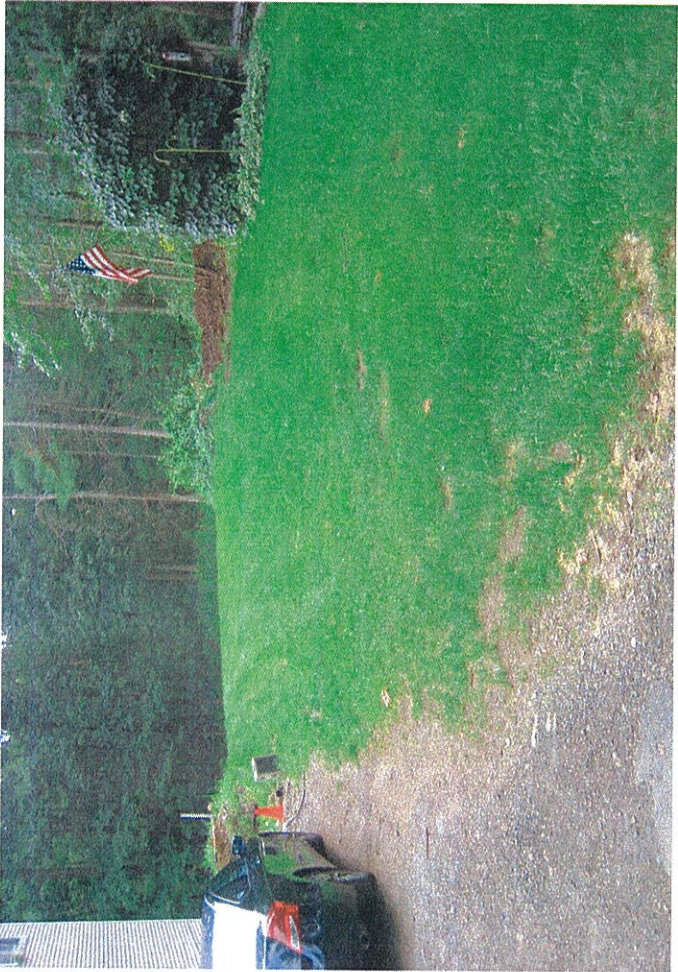
Existing lawn right side of house