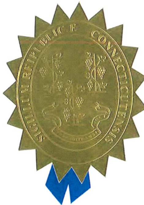
Ned Lamont Governor